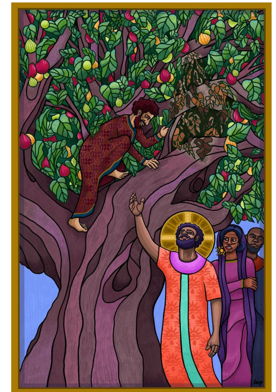
Everything Between righteousness & Mercy

Fifth Sunday in Lent April 6, 2025 10:30 a.m.